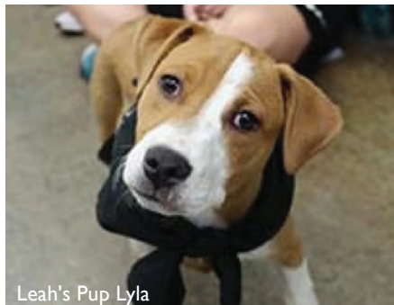
Leah's Pup Lyla