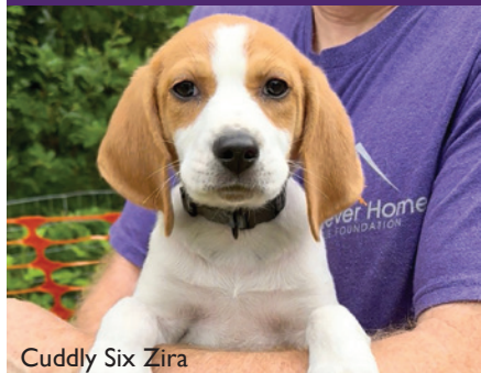
Cuddly Six Zira