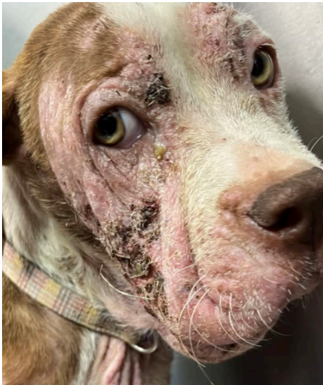
Meela is now with AFH and waiting for her forever home.

Please consider fostering or donating. Your support helps us continue to assist these extraordinary organizations. Donate today at https://givebutter.com/aforeverhome .