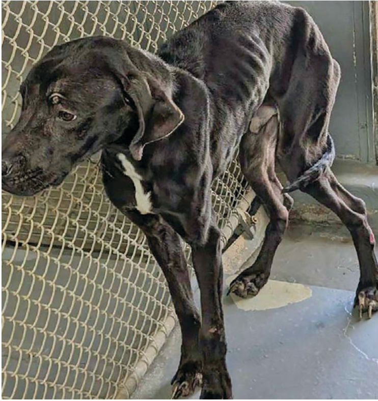
Damon, a Great Dane mix, came to AFH 20 pounds underweight and left happily with a loving forever family.

Damon arrived from transport covered with pressure sores on his back, ears, and legs. His bones were sticking out and he had chewed his tail so badly, it was raw and bleeding to the extent that we feared he might lose it.