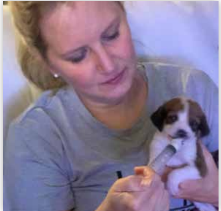
Getting so much stronger and better at eating at 4 weeks old

a sinus infection. We started antibiotics, which made her feel better, but she flat out refused the dry food. All she wanted was formula and lots of it.