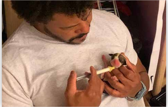
Trying to learn to eat from a syringe at 1 day old

the others did. Even when we tried to help her, she wouldn't stay latched on. I consulted a friend who had done this before, and she said I could try feeding her with a dropper and she gave me some to use.