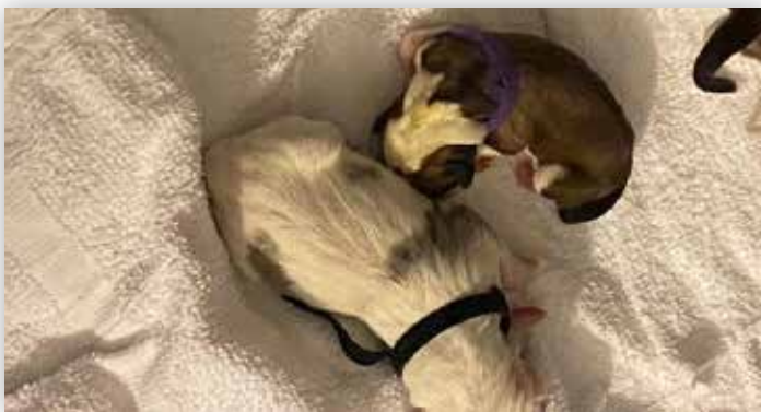
Ursula, the smallest puppy, next to Joey, the biggest puppy, the day they were born

My family and I have been fostering dogs for 2 ½ years but this was the first time we considered taking in a pregnant dog. Something about Mindi's picture just got to me and I wanted to help save her and give her a safe place to have her puppies. We read everything we could about what to expect and sought the advice of more experienced fosters, and fortunately Mindi's labor and delivery was textbook smooth.