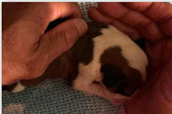
Still so tiny and struggling to gain weight at 5 days old

Slowly but steadily, she began to gain weight. While her littermates gained about 2 ounces a day, Ursula gained about a quarter to a half (if we were lucky) of an ounce per day. She started to get better at taking the syringes and we were steadily increasing the amount of formula she ate, but we knew that she couldn't be on formula forever, and no matter how careful we were, she still got some in her sinuses.