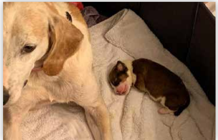
Even though she couldn't nurse, she wanted to be close to her mama