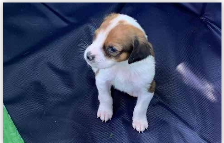
At a photo shoot with Leesburg Lifestyle magazine at 4 weeks old

The professionals we spoke with said to give it time, and sure enough, about a week later things just seemed to click and she was eating dry kibble right along with her siblings. She even learned to drink water out of a bowl by lapping the water and then tilting her head back to keep the water from coming out of her nose. Now, except for the fact that she's still quite a bit smaller than her littermates, she seems like a normal dog. She is completely worth every minute of the process!